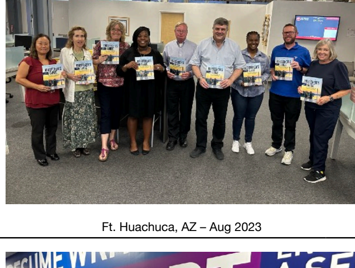
Ft. Huachuca, AZ – Aug 2023