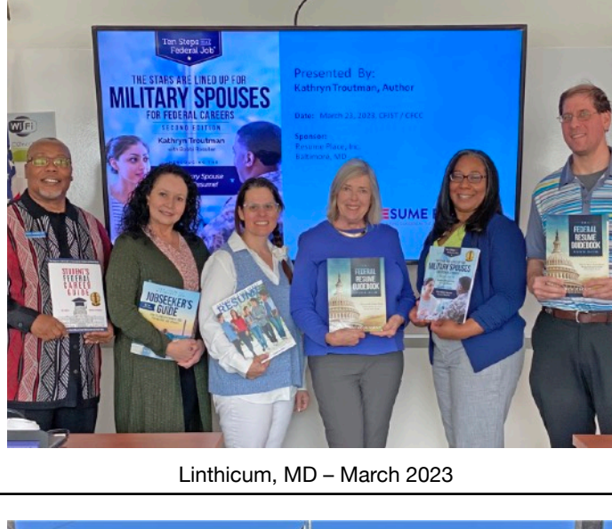
Linthicum, MD – March 2023