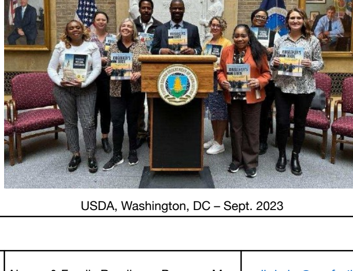
USDA, Washington, DC – Sept. 2023